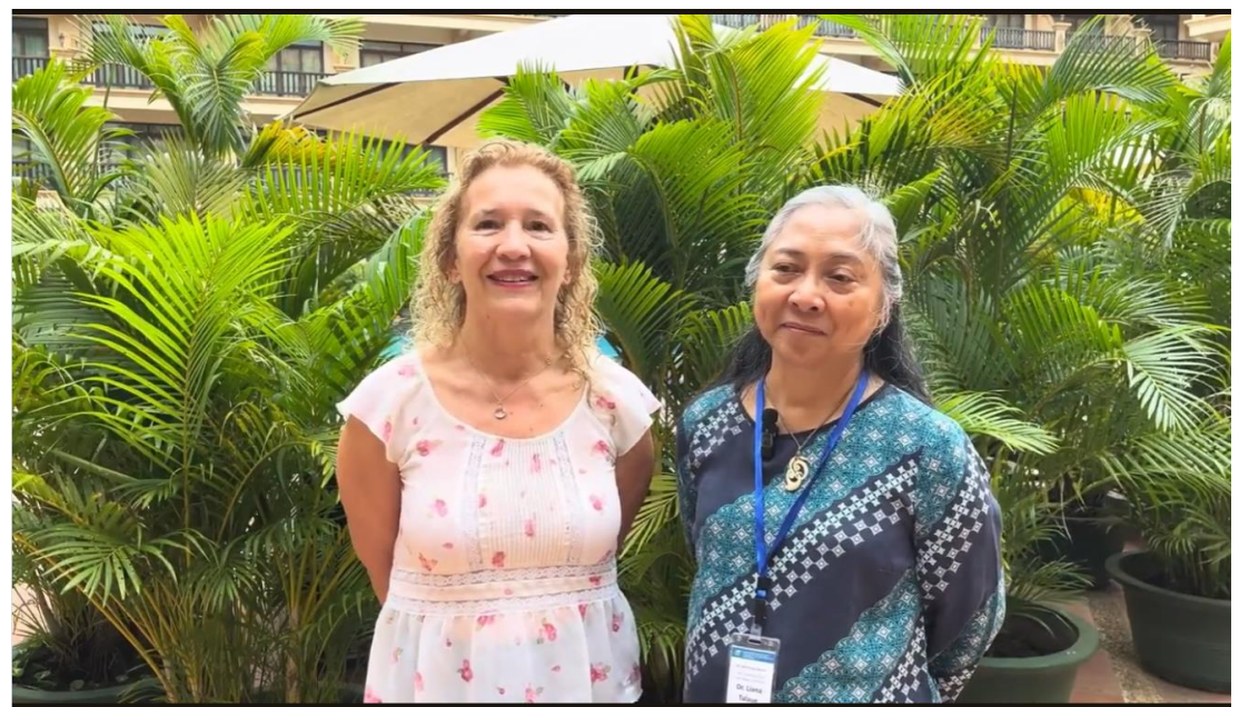
2024 SCSSAP and COBSEA Joint Retreat