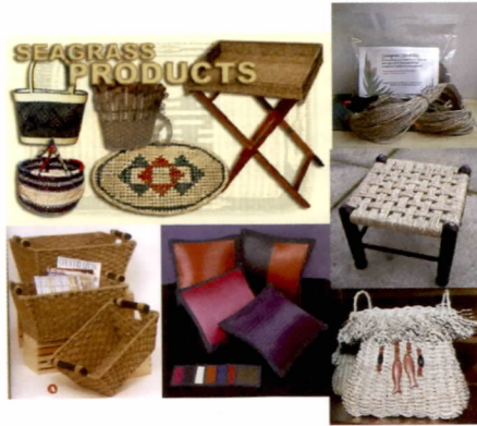
Handicraft products made from seagrass, the Philippines

Fishing grounds. Seagrass beds are the primary habitat for a number of commercially important marine resources, and hence are important fishing grounds in all participating countries.