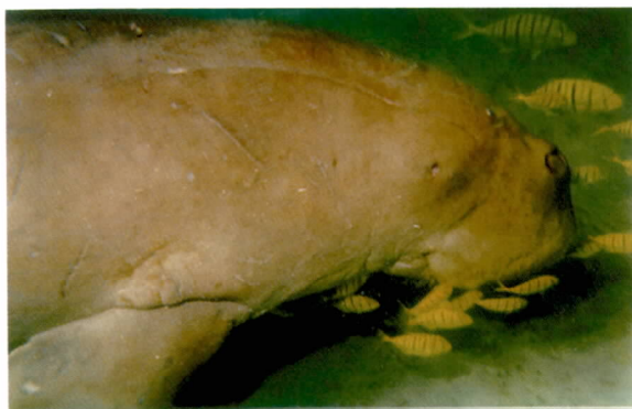
Dugong photographed in Con Dao, 1998

Dugongs and seagrass. Dugongs are listed as vulnerable to extinction on the IUCN redlist, are threatened throughout their distributional range, and feed almost exclusively on seagrass. All species of seagrass are eaten and populations are expected to decline because of the gradual loss of seagrass beds.