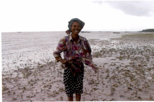
Collecting gastropods from seagrass beds, Viet Nam

Fishing grounds. Seagrass beds are the primary habitat for a number of commercially important marine resources, and hence are important fishing grounds in all participating countries.