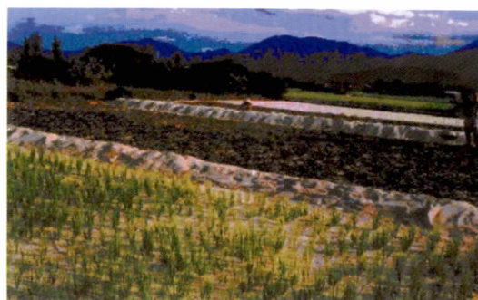
Using seagrass for fertilizer in rice fields in Khanh Hoa province, Viet Nam

Fertiliser and Animal feed. In some parts of Indonesia, Philippines, and Vietnam, people cut seagrass for feeding to their cows, goats, and other farm animals. Seagrasses are also used as a fertilizer in the Philippines. Coastal inhabitants from Quang Ninh province (bordering China) to Thua Thien-Hue and some districts of Khanh Hoa province, in Vietnam, harvest seagrass (mainly Zostera , Ruppia , Enhalus , Thalassia species and other Hydrophytes) for fertiliser and animal feed.