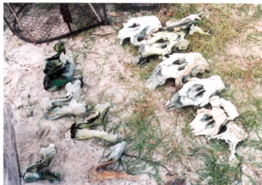
Dugong skulls on Phu Quoc Island

But it is the tusks that are especially valuable, with a large pair (usually from a mature male) selling for up to 10 million VND, or approximately US$650. Two dugongs were caught and butchered for their meat in Vietnam in June 2003 in Ha Tien town, Phu Quoc Island, according to state media. The biggest direct threat to dugongs however is the use of fixed fishing nets in shallow seagrass beds. On Christmas day, 2003, a dead dugong was washed ashore on Phu Quoc Island, after becoming entangled in a gillnet.