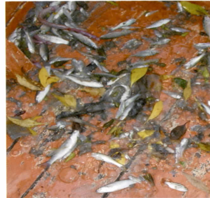
Juvenile fish and invertebrates from seagrass beds are a common by-catch in trawl fisheries

In the Philippines, Acetes spp. (small shrimp) and juvenile rabbit fish, important for food security of local communities, are harvested from seagrass beds as is the seahare, Dolabella auricularia , an economically important shell-less, mollusc. The egg mass of this species contains 60% protein and is consumed fresh.