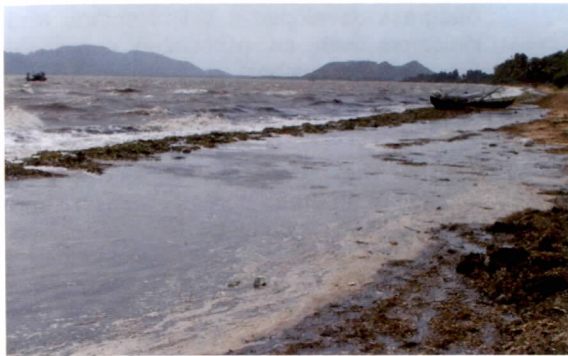
Seagrass uprooted by trawlers

In Cambodia, illegal fishing by trawlers in seagrass areas for fish, shrimp, and other invertebrates, is a significant cause of damage to seagrass beds. Seaweed farming on the seagrass bed of Kampot province may inhibit the growth of seagrass due to increased competition for nutrients and sunlight. Along the developed coastal areas of Cambodia solid and liquid wastes are discharged directly to the sea, having a detrimental effect on seagrass and other marine habitats. Up-land forests have been cleared for timber and agriculture, and large amounts of sediment are carried by streams and rivers to seagrass beds, causing high turbidity and blocking the penetration of sunlight.