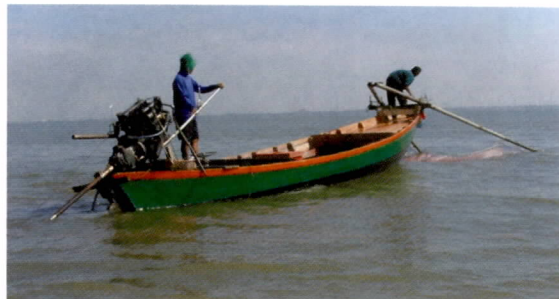
Push netters damage seagrass beds

aquaculture, and capture fisheries, resulting in the destruction of seagrass beds. Shrimp and fish culture, shellfish collection, explosive fishing methods, electric fishing, poisons, trawling, pollution, and dredging for ports and channels are among the major threats to seagrass in China.